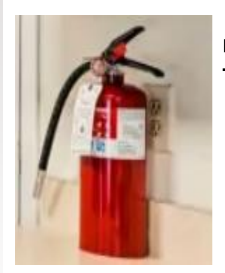
FIRE EXTINGUISHER - located in the kitchen

Please take time to locate these safety items when you first arrive.