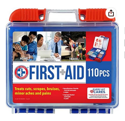
FIRST AID KIT – located in the kitchen junk drawer